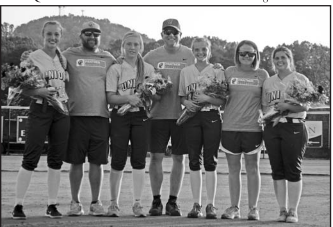
Senior softball players with coaches