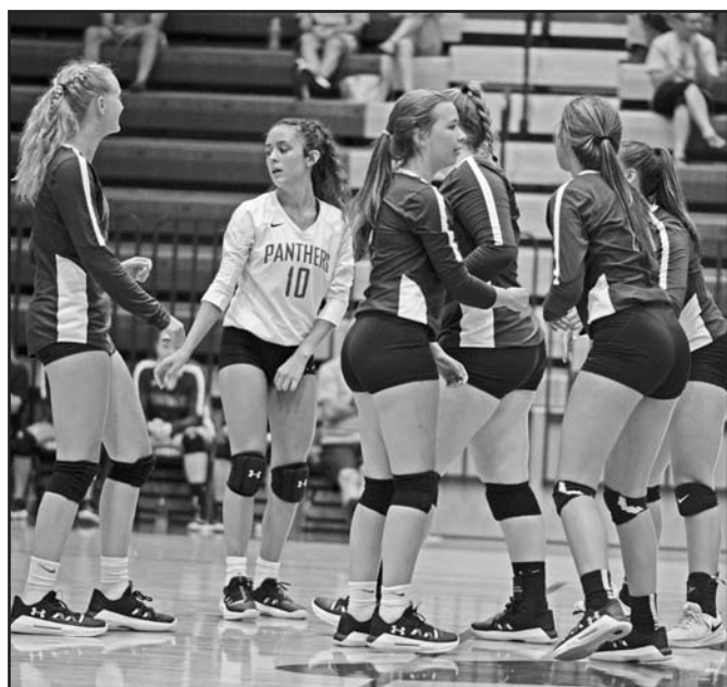
Union County Volleyball returns home this week to open Area play, beginning with a tri-match on Tuesday.

ville, North Carolina next Monday, Union County concludes Area play with last year's No. 2 seed, Lake Oconee Academy, on Tuesday, Oct. 1.