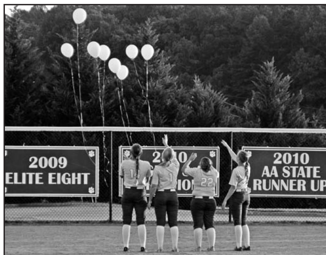
Seniors release balloons at the conclusion of the Senior Night ceremony

On Monday, Sept. 16, the Lady Panthers fell 6-0 to Madison County at the University of North Georgia. Additional info on those games plus Monday's contest with East Hall will be available in next week's North Georgia News .